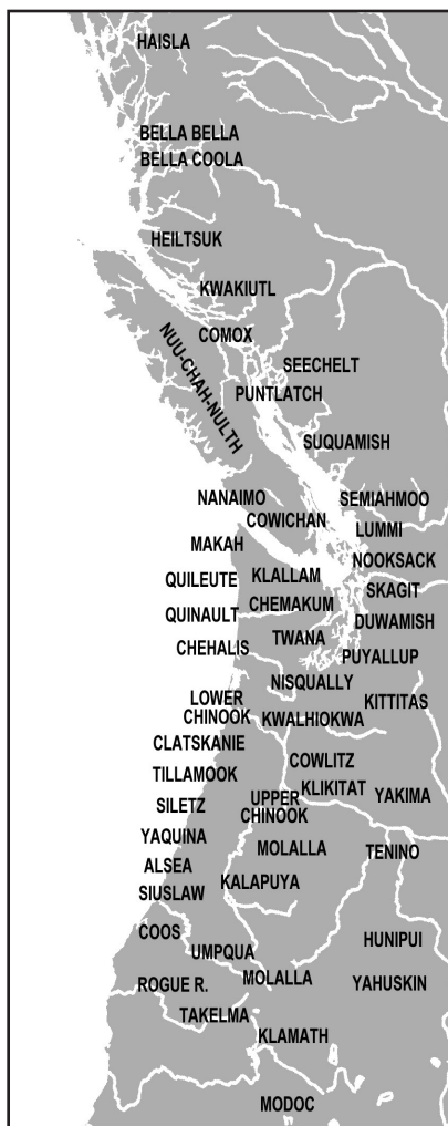
— Jeffrey Kopp

This map shows some of the many indigenous languages of the Pacific Northwest. No one person could ever learn all of them. A trade language is useful under this condition.